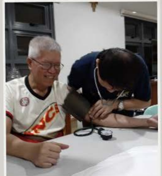
Clergy Health Care